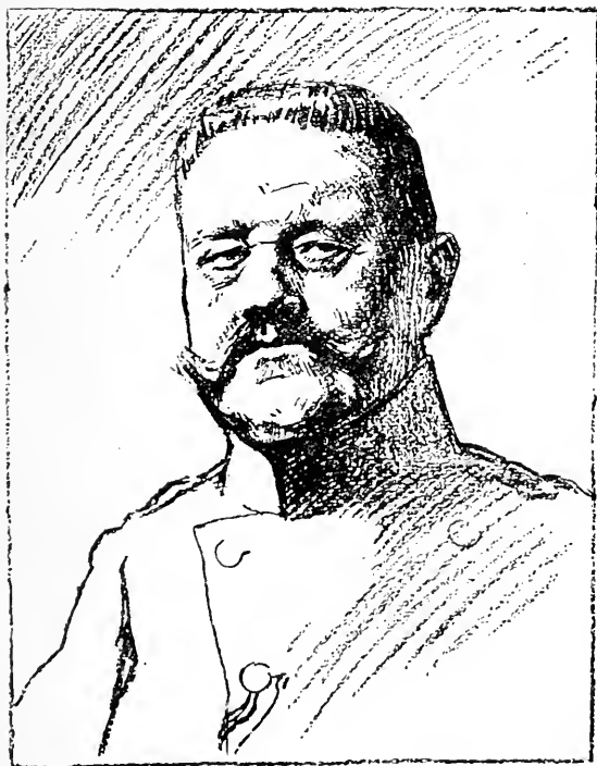
General von Hindenburg